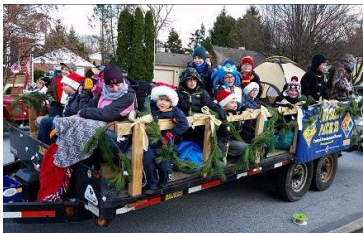
Pack 23 in the Downingtown Christmas Parade - note the tent in the trailer - Go Scouts!